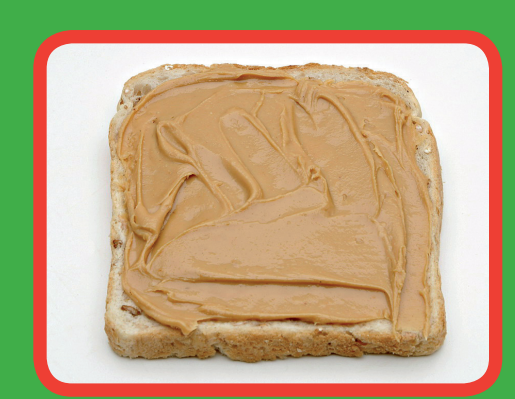
No Added Sugar