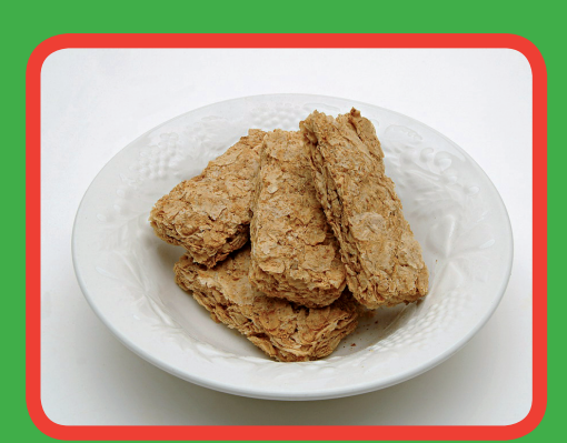
No Added Sugar