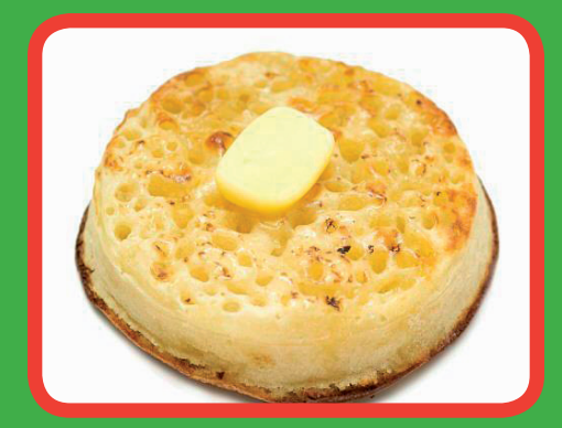
No Added Sugar